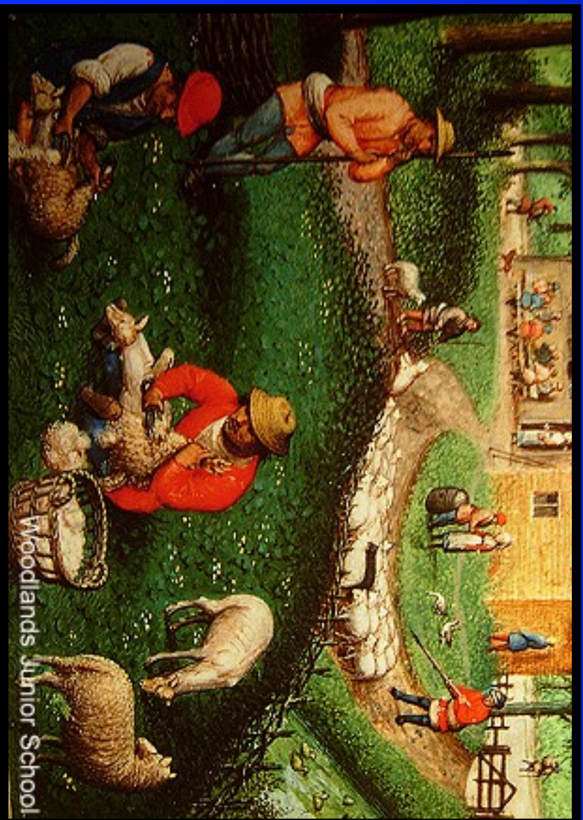
Woodlands Junior School

Elizabeth I wore so much powdered lead that she died in 1603 of lead poisoning .